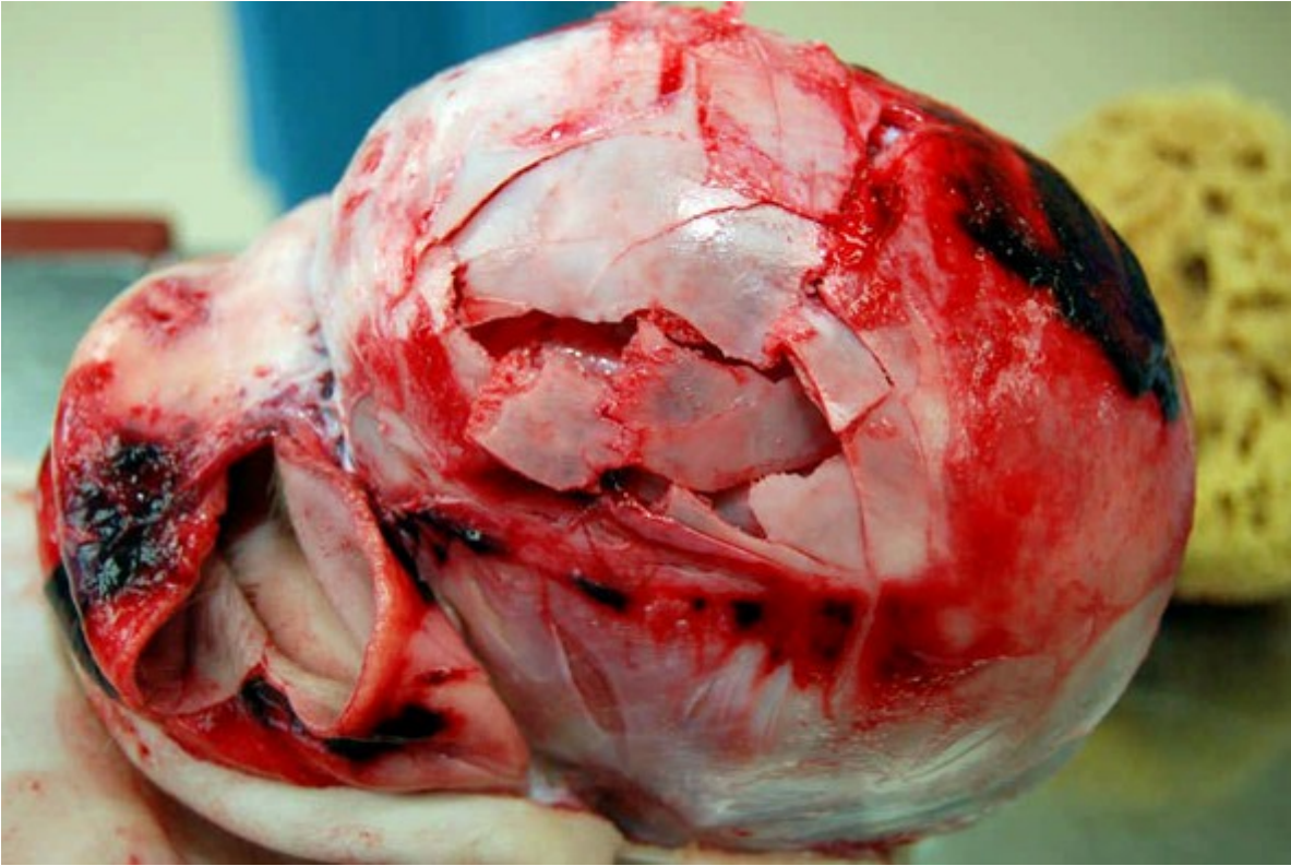
Max, 4 years and 10 months old.