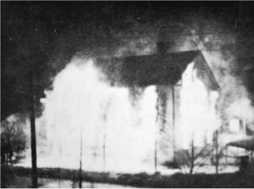
Norrskensflamman. Fully developed fire.

The photo has been shot about 5 minutes after the explosion. The photographer was a tenant in a property opposite to Norrskensflamman at Kungsgatan.