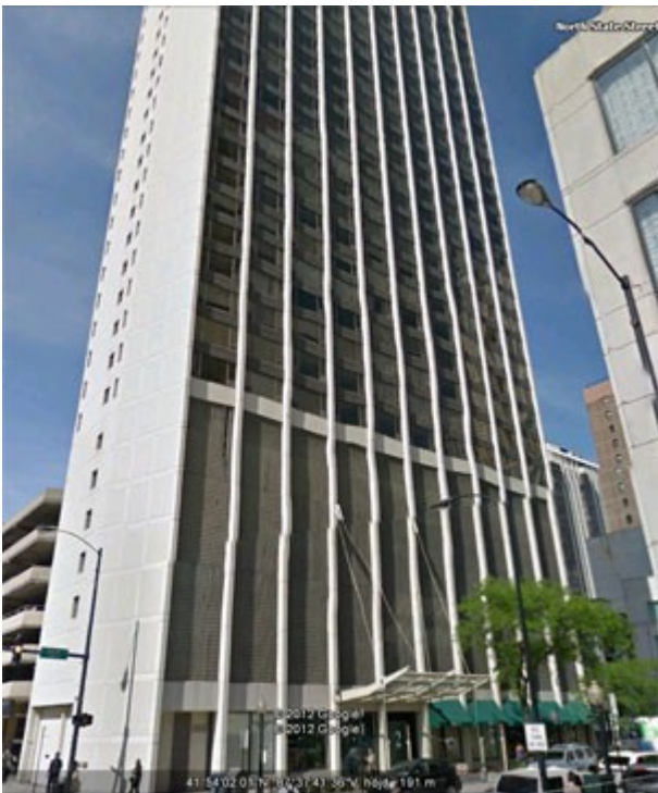
2 East Oak St. Chicago.

In the summer of 1978 I received a letter from my colleague and successor at the Swedish Trade - LH ( MBA ) . I had helped LH to get started in Chicago. I helped when he sought for an apartment . His choice fell on a high rise building at 2 East Oak Street , about 40 stories high .