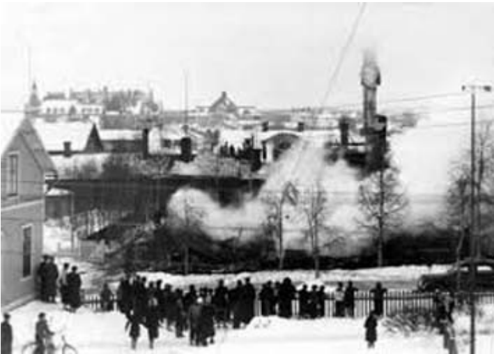
Norrskensflamman. Only the chimney remains.

The photo has been shot about 5 minutes after the explosion. The photographer was a tenant in a property opposite to Norrskensflamman at Kungsgatan.