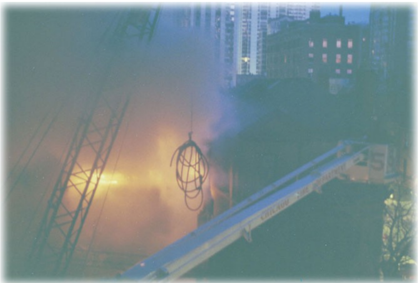
Fully developed fire at 55 East Scott St., Chicago.

During my stay , I lived in a condominium at 65 East Scott Street . The area was classified as safe. As usual in such buildings there was always a doorman in place around the clock. The building manager was a parant lady in her 40's . When I met her the first time for checking the apartment it was immediately clear to me that strong credentials were required to rent in this building. I left my credentials and after about a week everything was cleared . As early as day 1 , I received clear information about which regulations were in force . If one couldn't obey it there was only one way to go, i.e. OUT . I had a good relationship to the doormen who worked there . The manager I didn't see that often but now and then we met at the entrance. Mostly she wanted to get a confirmation that I enjoyed with my accommodation . Everything worked fine and I had nothing to complain about. One night in April -77 I awoke to the smell of smoke inside the apartment. When I looked closer , I saw heavy smoke emission from a smaller building located about 50 yards from my apartment (photo below). My air cond sucked smoke into the apartment. I turned off the conditioner and could see that the fire department was already in place. I had previously noted that the building seemed discarded and uninhabited. I didn't think closer about this event because fires were commonplace in this city.